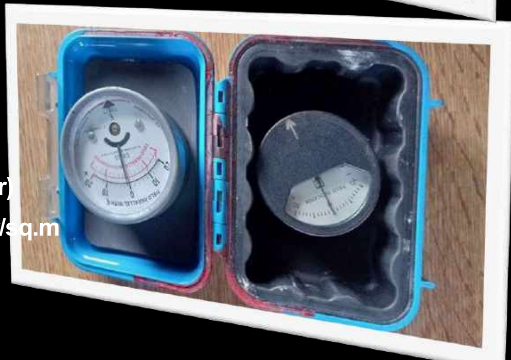
Gauss meter (magnetic field indicator)

Specification: 1 Gauss= 10^{-4} weber/sq.m