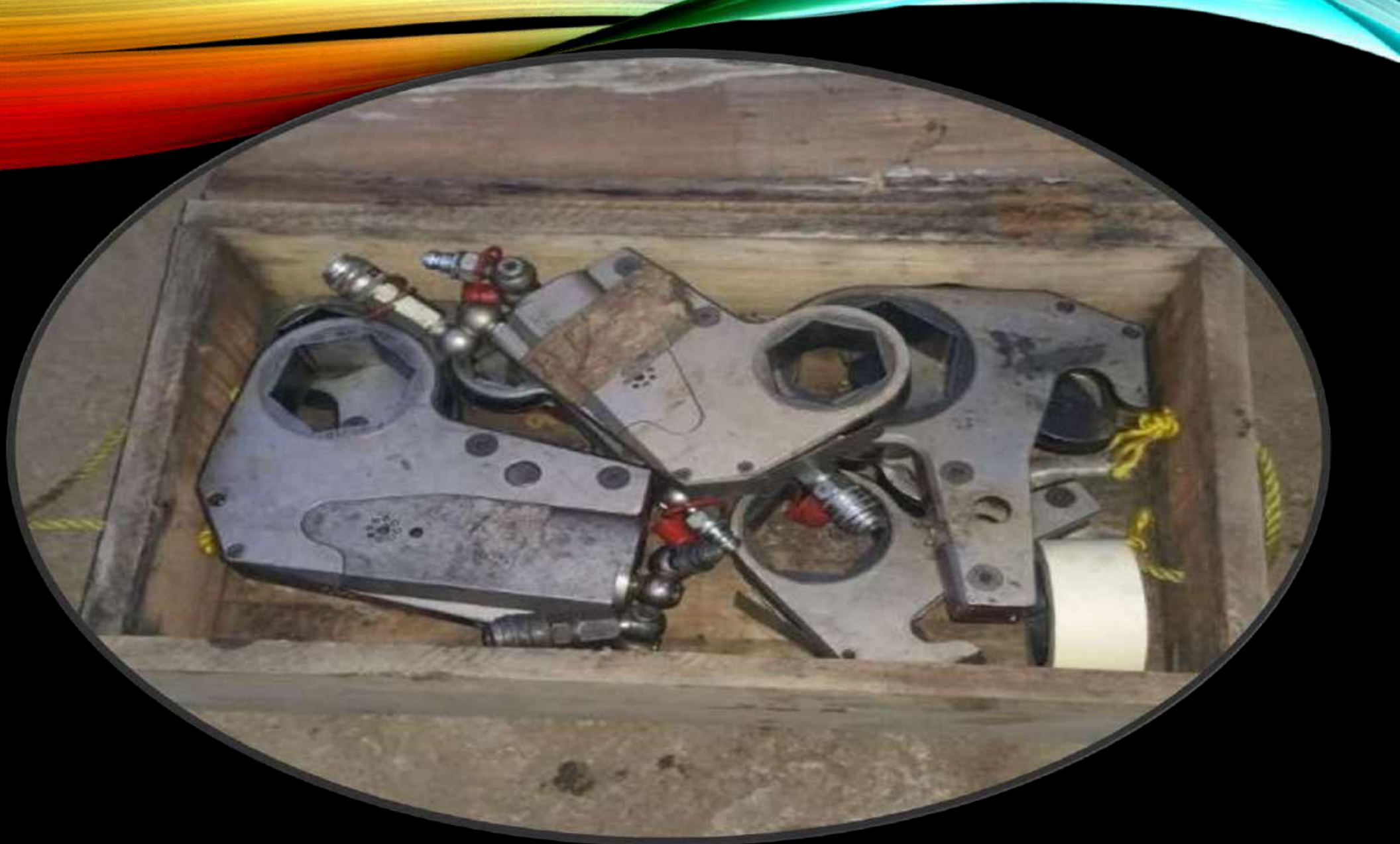
Accessories (Hydraulic Torque Wrench of various sizes)