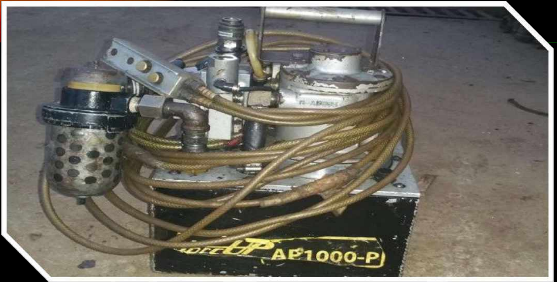
Hydraulic Hose on Machine