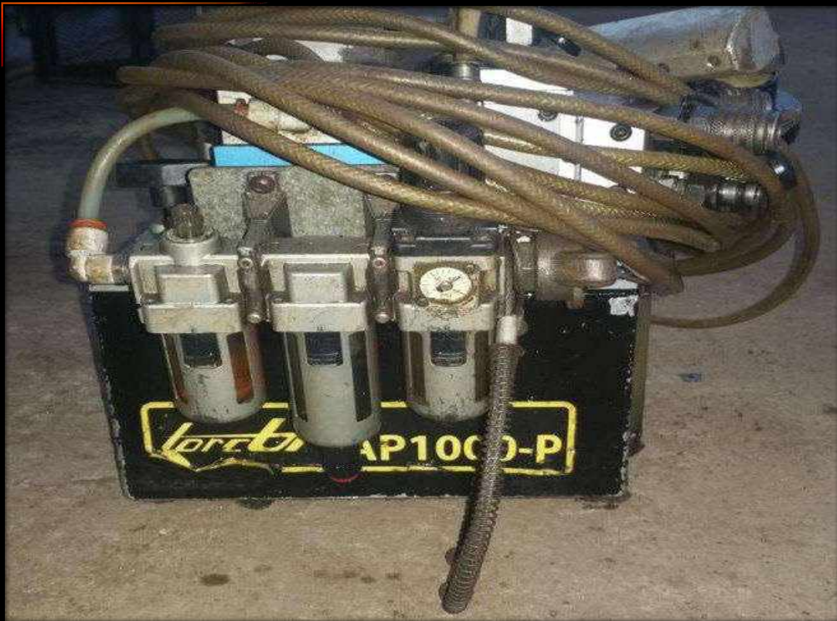
Pneumatic Hydraulic Power Pack Unit